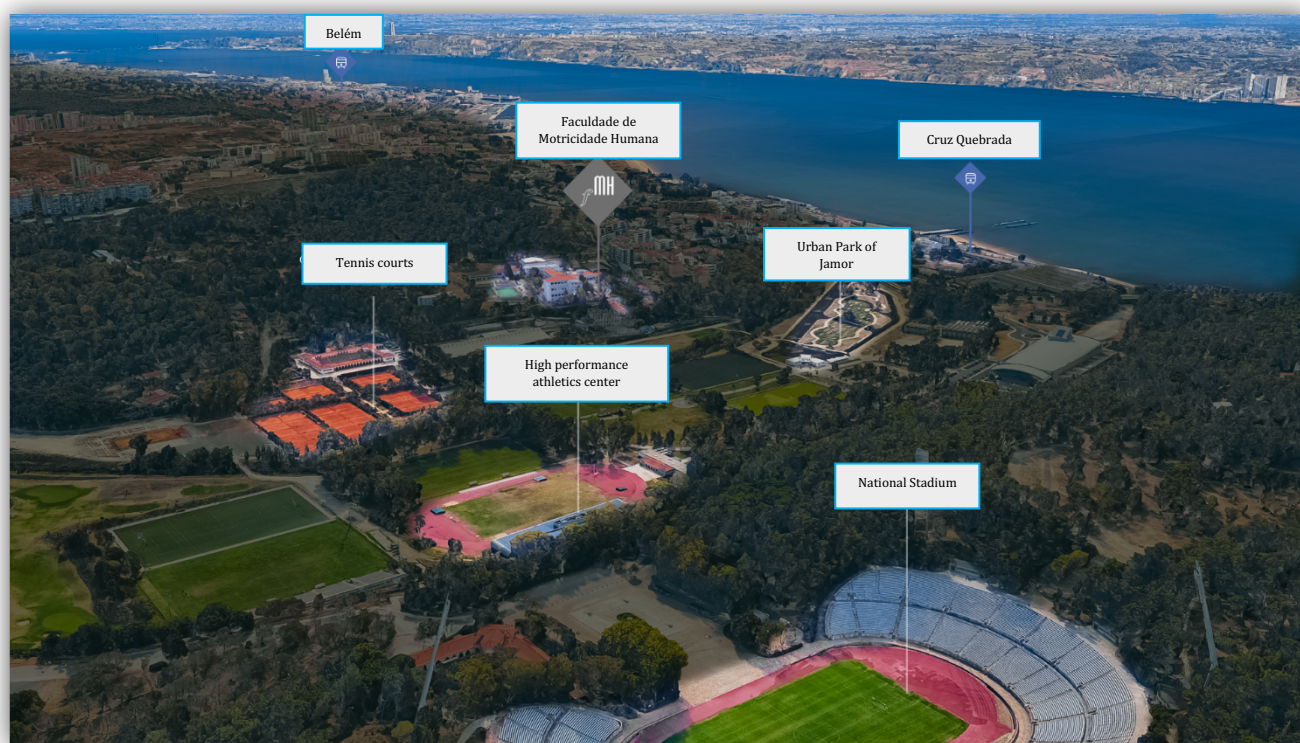
Event location and surroundings