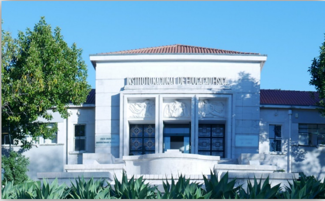
FMH - Faculdade de Motricidade Humana