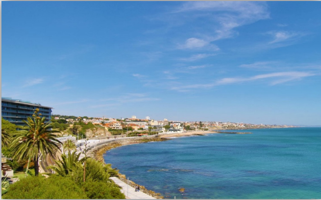
Beach Area (Marginal Avenue)