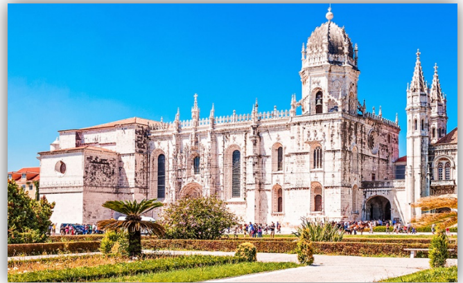
Monastery of Jerónimos